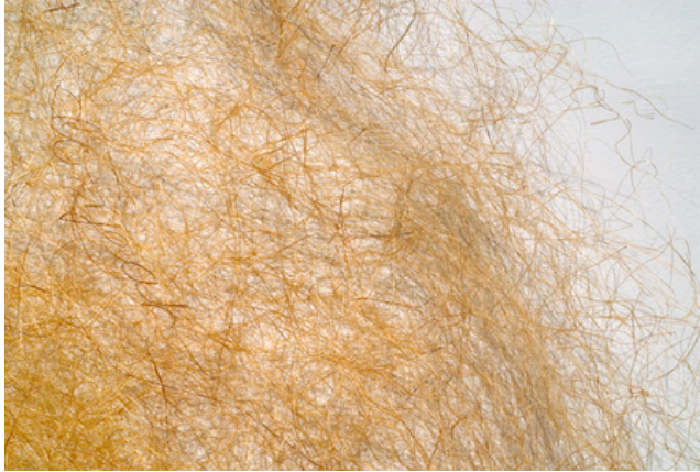
David Merritt untitled (you've lost that) 2009 Courtesy the artist David Merritt untitled (you've lost that) 2009 Courtesy the artist